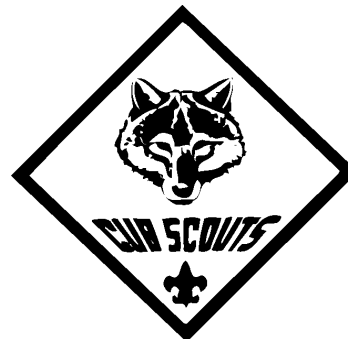
(For 2 nd -5 th grade boys)

Cub Scouting is a home and neighborhood-centered program designed to support family life for boys in second through fifth grades. Each Cub Scout learns to respect his home, country, God, and other people. The program also helps boys this age to: