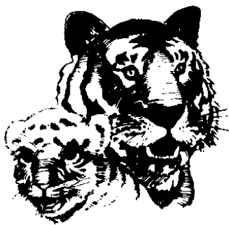
Tiger Cubs, BSA (For 1 st grade boys)

Tiger Cubs is a one-year program for first-grade boys. Each boy participates with a parent (or another adult family member) in family-oriented activities. These include things from family camping to preparing for emergencies.